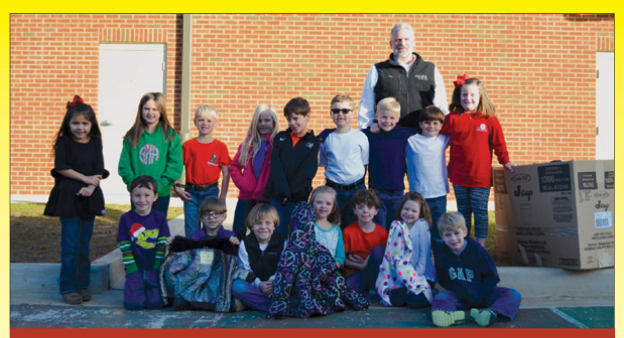
Mitchell EMC would like to thank Westwood Schools for helping us with the Coat Cover-up Drive. They donated many good used children's coats for needy kids in the area.